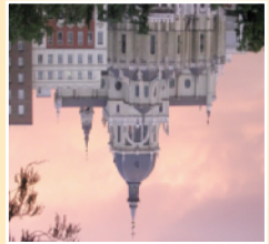
This One-of-A-Kind Event! Flexibility and Networking Highlight

DIA DRUG INFORMATION ASSOCIATION THIS EVENT IS PART OF THE CLINICAL FORUM 2007 OCTOBER 15 - 19, 2007 AUDITORIUM MADRID HOTEL, MADRID, SPAIN